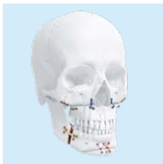
MatrixORTHOGNATHIC™ Plating System