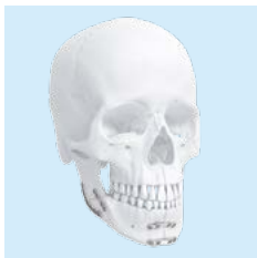
MatrixMANDIBLE™ Plating System