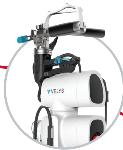
Intra-op robotic-assisted surgery