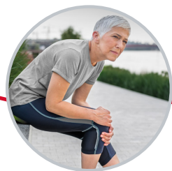
Decision to do surgery