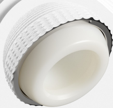
BI-MENTUM™ DUAL MOBILITY SYSTEM