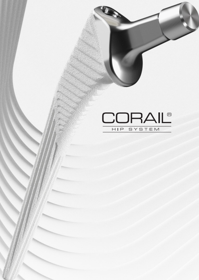
CORAIL® HIP SYSTEM