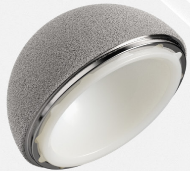
PINNACLE® ACETABULAR CUP SYSTEM