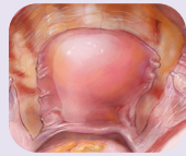
Pelvic Sidewall (Soft Tissue)

Will primary methods of hemostasis be effective or practical?