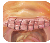
Vaginal Cuff (Suture Needle Hole)