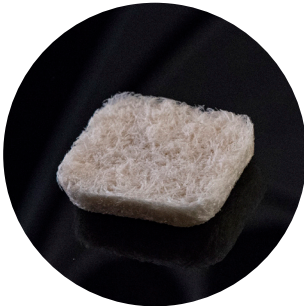
100% bone fibers