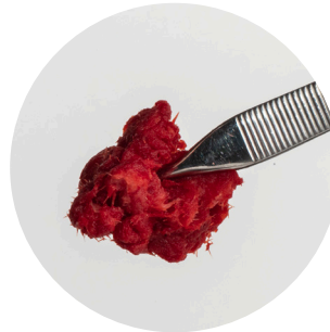
Moldable upon rehydration