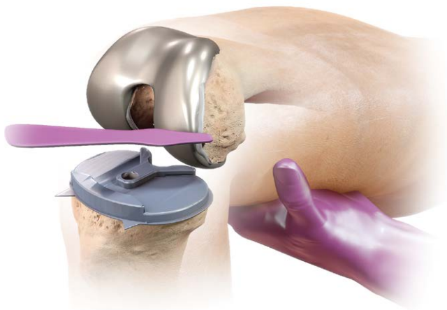
Example of cement cleanup around a femoral component

■ NOTE: Care should be taken to remove excess cement or cement debris which may scratch the implant which may lead to polyethylene wear debris. 18