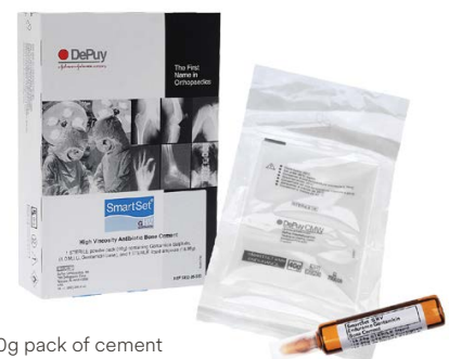
Example of one standard 40g pack of cement

A thin layer of cement may not be sufficient to achieve good penetration into the bone. Sufficient cement must be applied and two mixes of standard (40g) packs of cement are often used in cementing the femoral and tibial components of a TKR to provide an adequate layer to facilitate cement pressurization. One 20g pack of cement is sufficient when cementing the patella alone.