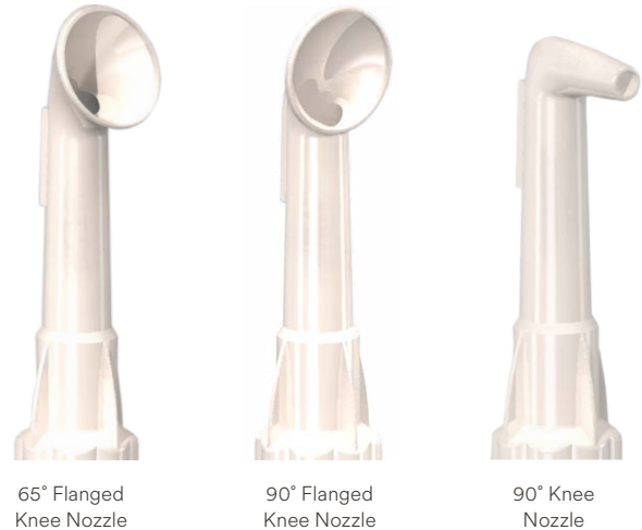
65° Flanged Knee Nozzle