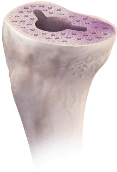
Example of drilling keying holes in sclerotic tibial bone