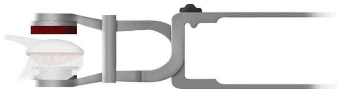
Example of using a patella clamp

If applying cement to the bone it should be pressed sufficiently into the bone surface and peg holes prior to introducing the patella implant. Alternatively, a thick bed of cement can be applied to the implant. A clamp is then used to fully pressurize the cement.