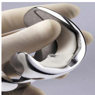
Example of applying cement onto the back of the femoral implant

A thick bed of cement may be placed onto the back of the implant or directly onto the exposed bone surface. An impactor is used to pressurize the cement. Good levels of penetration can be achieved by applying cement to the anterior and distal bone surfaces, and to the posterior flanges of the prosthesis prior to implantation. 21