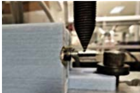
Screw Cantilever Bending Load

The locking strength of the MatrixRIB™ Self-Drilling Locking Screw is 3X greater than the Zimmer Biomet self-drilling screws based on cantilever bending tests.*