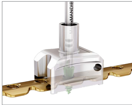
Plate and Splint Screw Guides aid in alignment, insertion and locking of MatrixRIB Self-Drilling Screws into MatrixRIB 1.5mm Plates and IM Splints. 2