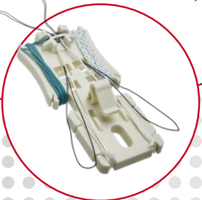
RIGIDLOOP™ BTB Adjustable Cortical System