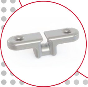
RIGIDLOOP™ Clip Cortical Button