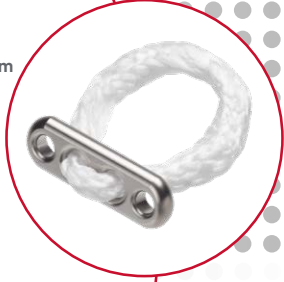
RIGIDLOOP™ Cortical System