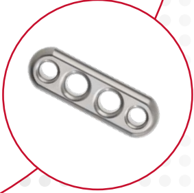
RIGIDLOOP™ Titanium Button