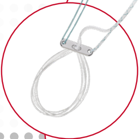
RIGIDLOOP™ Adjustable Cortical Fixation System