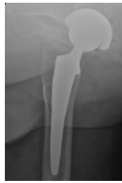
Lack of radiolucent lines demonstrates excellent fixation.