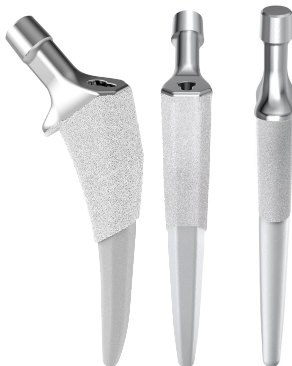
Horizontal plane grows 1 mm in the A/P per size

The ACTIS Total Hip System was designed to increase 1 mm in the anterior/posterior dimension in the horizontal plane consistently between each size stem. Additionally, the anterior/posterior taper of the ACTIS Total Hip System increases 0.25 degrees per size and designed to achieve proper fit across the entire range of stem sizes.