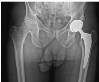
A/P Pre-operative image. 1 Year A/P post-operative image of the ACTIS Hip System on the same patient's left hip.