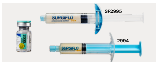
SURGIFLO™ Hemostatic Matrix Kit with Thrombin