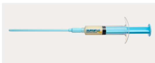
SURGIFLO™ Hemostatic Matrix