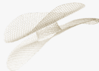
PROLENE™ Polypropylene Hernia System