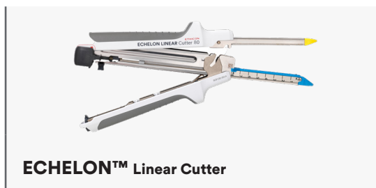
ECHELON™ Linear Cutter